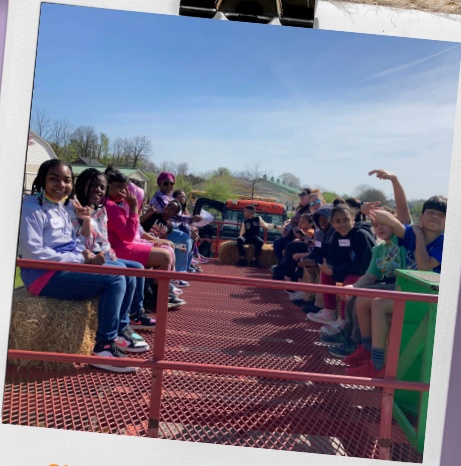
Glyndon Elementary School, Baltimore County