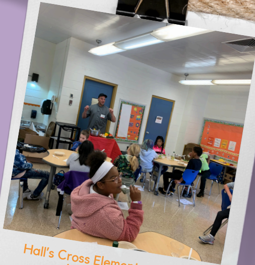
Hall's Cross Elementary School, Harford County

"These were the best 3 days of my life, except getting close to the bee was a scary part." Guilford Elementary School, Howard County