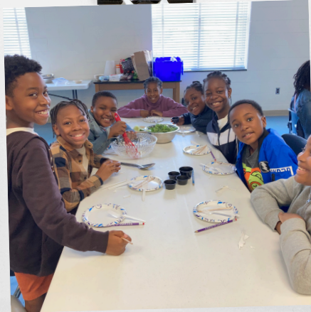
Dogwood Elementary School, Baltimore County