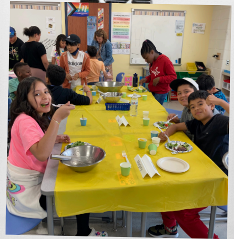
Talbott Springs Elementary School, Howard County