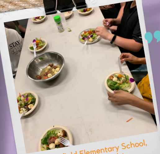
Bakerfield Elementary School, Harford County